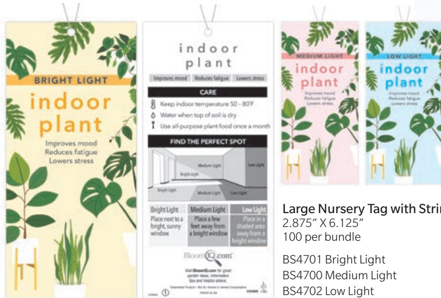
Large Nursery Tag with String 2.875" X 6.125" 100 per bundle BS4701 Bright Light BS4700 Medium Light BS4702 Low Light